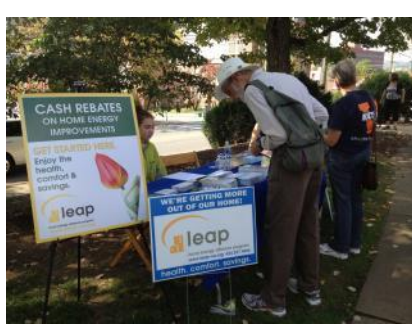
Charlottesville Veggie Fest

LEAP staff log many hours on the phone with clients, in meetings with contractors, and on the road visiting both. But you might have seen us out and about in the community at these events in 2013: